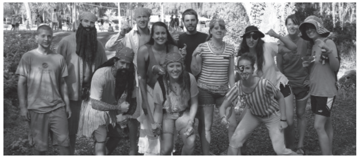
Yo-ho, yo-ho, a camper's life for me: Counselors dressed as pirates in search of treasure at Camp Flastacowo, a day camp based at the Florida State University Reservation. The camp is a treasure in itself, having earned a perfect reaccreditation score this year from the American Camp Association.

Camp Flastacowo was first accredited by the American Camp Association in 2009 and is the only American Camp Association-accredited camp in Tallahassee.