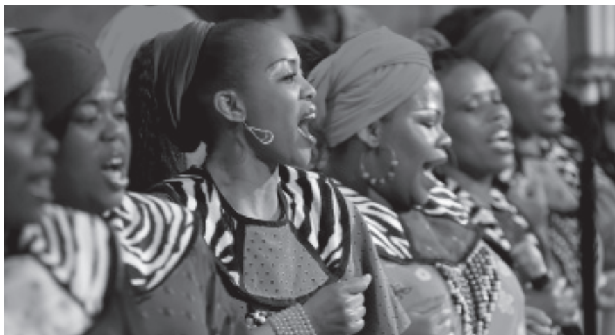
The Soweto Gospel Choir

For a complete listing of performances, visit www.sevendaysfestival.org . Tickets are available online at www.tickets.fsu.edu .