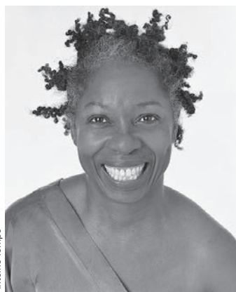
Jawole Willa Jo Zollar