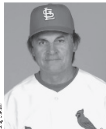
Anthony "Tony" La Russa Jr.